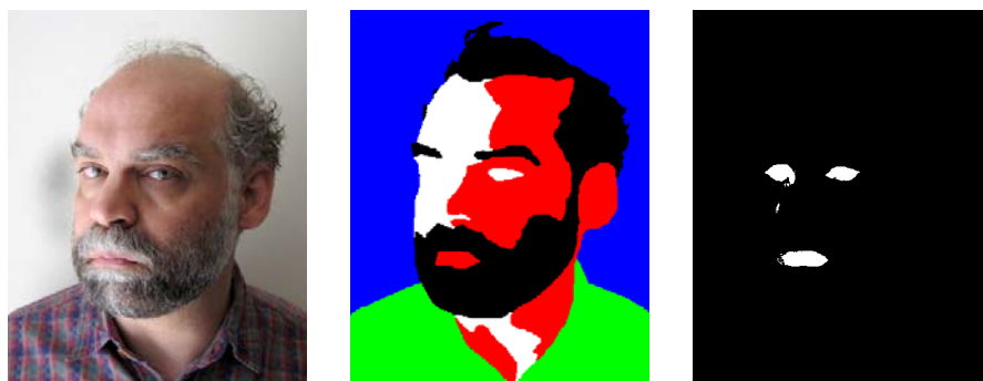
Fig. 1. Initial Image (A), Tone Map (B), Object/Focus Map (C).

dominant and sub-dominant value parameters also can rescale how the system analyzes/uses the source image. This is an example where painterly knowledge rules can supersede the information from the source sitter image (the sitter photograph) by filtering, emphasizing/de-emphasizing, and scaling input information as well as by other rule based means.