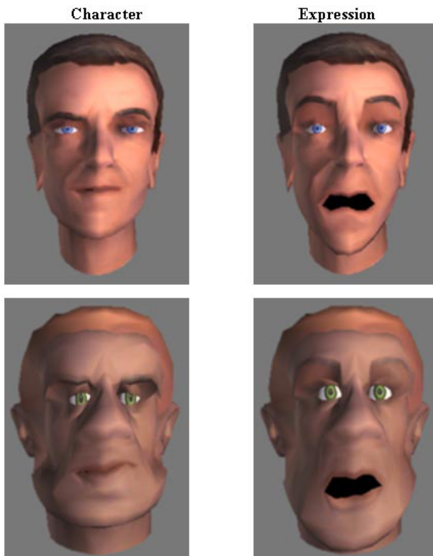
Figure 3. Two characters with the same "fear" expression applied to each. The "fear" behavior creates the impression of fear that is recognizable, but unique to each face. Note how the asymmetries inherent in the bottom character are preserved.