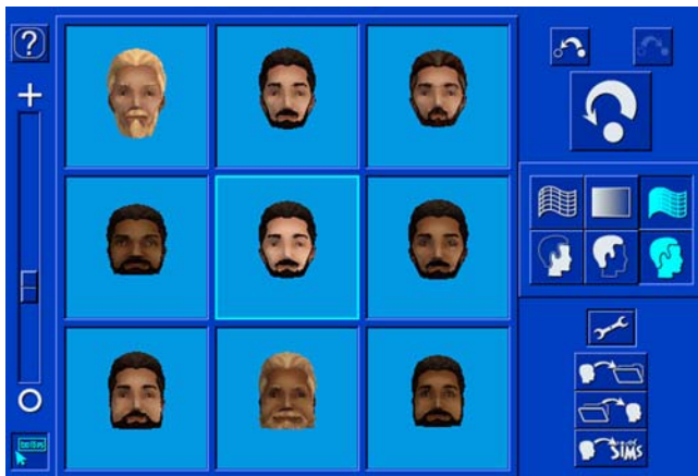
Figure 2. Using a genetic algorithm technique to browse through face space, this early prototype was commissioned by Maxis for their popular game “The Sims”.

This system uses a genetic algorithm technique known as aesthetic selection [4] to search through face space, using approximately 25 parameters to specify the genotype. In this prototype, a menu of random faces is generated from random points in face space. By selecting one of the faces, the user is able to surf through the local region centered around the selected face and can increase or decrease the local region of similarly looking faces by the use of a mutation rate slider and other controls. In this way, novice users can “find” or breed a face or family of related faces that appeal to them for use in the game.