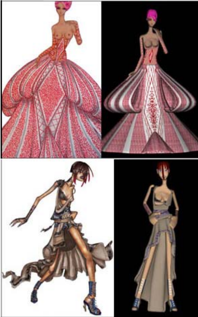
Figure 2. Collaboratively created cyber-fashion show: Original design sketches (white background) from FIT fashion designers are turned into 3D avatar models (black background) by SFU students via an iterative process - all using distance collaborative tools between two coasts and countries.

The overall project goal was to explore how online collaboration systems and virtual environments can be used practically for distance learning, fashion and virtual worlds design, development of new marketing tools including virtual portfolios, and creation of cross cultural online/physical events. The result of this process was an interdisciplinary, cross-institutional, international effort in collaborative design in virtual environments, and a successful exercise in emergent, collaborative distance learning.