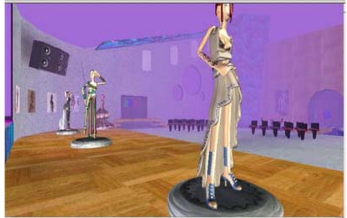
Figure 1. One of several 3D 'virtual fashion-cyber mystery show' spaces, here before the virtual crowds arrived. These models "wearing" original fashion designs are click-able, revealing additional 3D galleries of the designers' work.

Nowhere is this clearer than in the modern classroom, where both students and faculty need new conceptual frameworks and collaborative systems that leverage the strengths and benefits of the digital age. Today's educational system adapts too slowly, if at all, to the rapidly-changing economic realities of the increasingly digital marketplace. Students need new methods and strategies for development of skills and systems that bridge the gap between schoolwork and professional work and make them viable in the digital marketplace. Educational institutions must envision and define a wholly new pedagogy for the digital age. Educators must function as digital facilitators, not merely information providers. This new teaching and learning model, developed in and facilitated by digital data delivery formats, must be fast, flexible and fun if it is to compete in the digital landscape. It must be virtual, visual, collaborative, iterative and emergent.